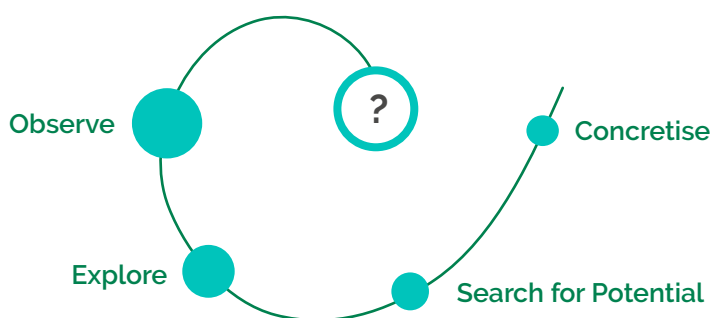
Figure 2. A Dialogic Process Model